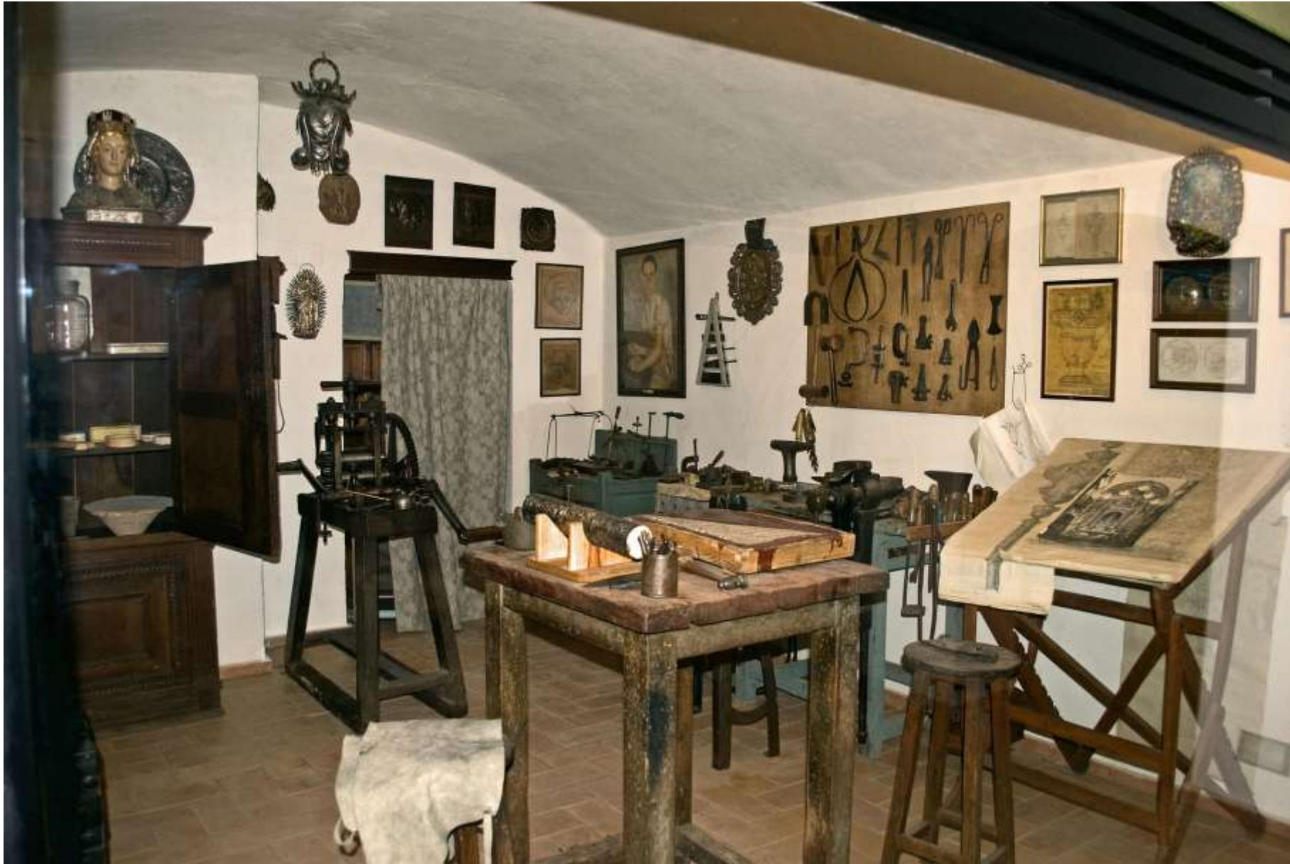
Museum of Art and Popular Customs